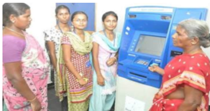
Awareness creation on "ATM working and its uses" at Perumbakkam village on 23/08/14 with 13 participants.